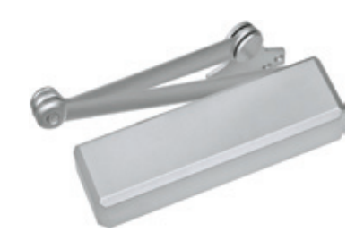
QDC115 Extra Duty Arm